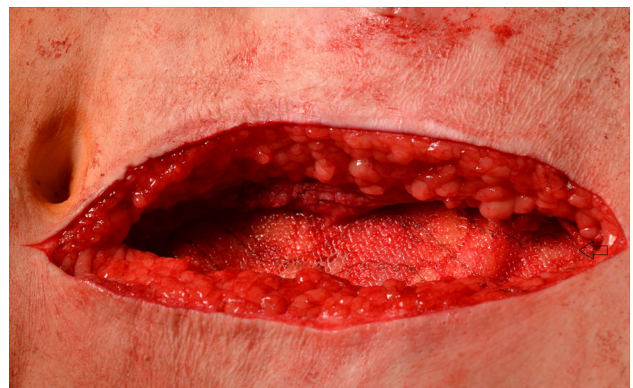
Fig. 3 Before closing the midline laparotomy the 3-D funnel mesh was used for additional reinforcement of the midline in open IPOM technique

technique (Fig. 3). The sutures were brought out through the abdominal wall on the right side of the midline incision with a suture-passer to ensure reinforcement of the laparotomy. Therefore, this was the only patient who required no additional separate flat mesh for midline reinforcement. On the 1st postoperative day, the patient unfortunately had to undergo a second urological procedure because of a urinary bladder leak that eventually led to a nephrostomy.